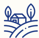
Coffee Estate Views