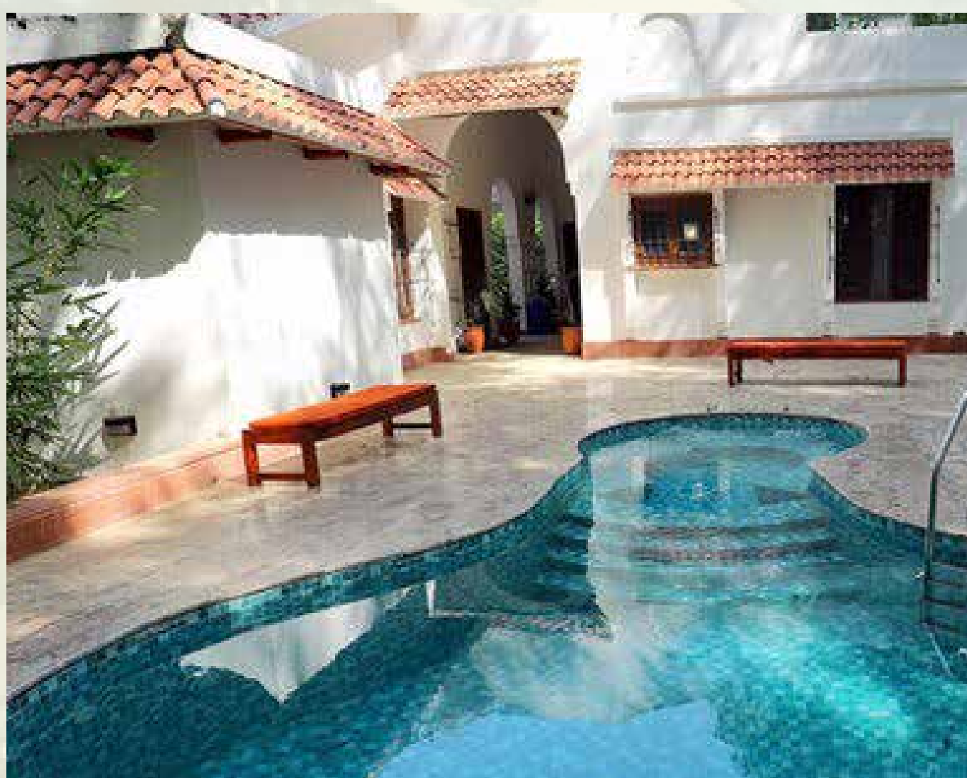
Relax by the Pool

Nestled in the tranquil landscapes of Delhi NCR, Lotus Villa offers a peaceful getaway. This villa has cosy bedrooms with views of a serene lotus pond and a private pool, ideal for a leisurely relaxation, making it the perfect haven for a rejuvenating stay.